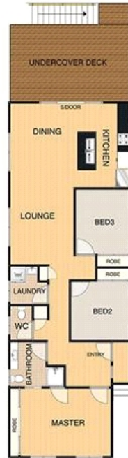
FLOOR PLAN: 99 OLD GYMPIE ROAD - KALLANGUR