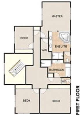
FLOOR PLAN: 6 CLAIRE LOUISE CT - MURRUMBA DOWNS