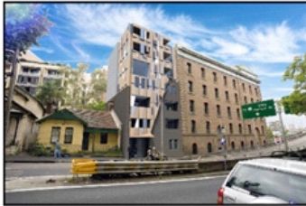
Mystique Apartments 170 Pyrmont St, Pyrmont NSW