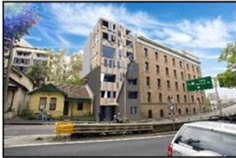
Mystique Apartments 170 Pyrmont St, Pyrmont NSW