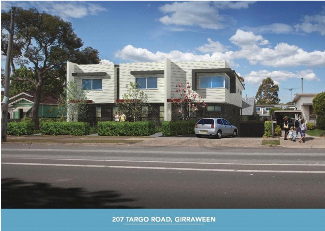
207 TARGO ROAD, GIRRAWEEEN