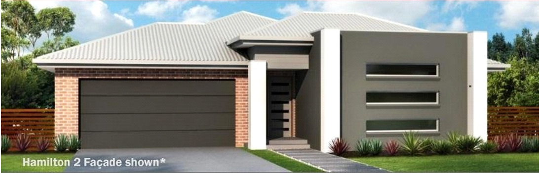
Hamilton 2 Façade shown*