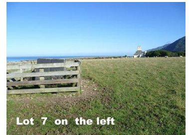
Lot 7 on the left