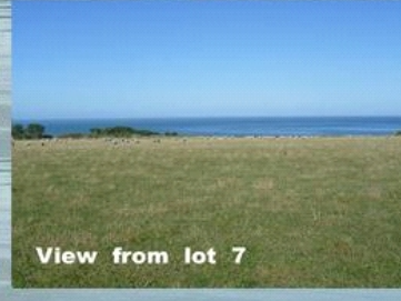
View from lot 7