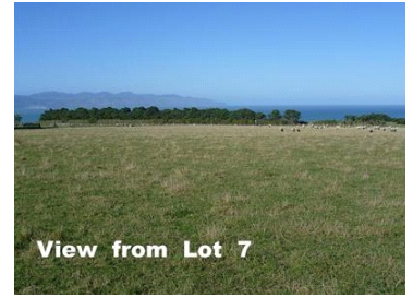
View from Lot 7